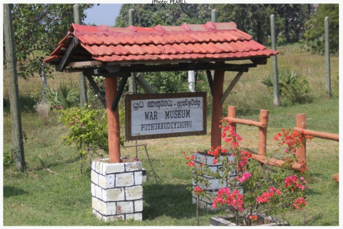
Signboard at the entrance of the "War Museum", in Puthukudiyiruppu, Mullaithivu, in Sinhala and English only. The museum contains weapons, boats and other things taken from the LTTE. Local residents see this as deliberate gloating over the deaths of tens of thousands of Tamils, and emblematic of the state's triumphalist attitude.